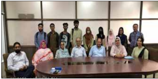
The NED Alumni Association of Canada is working for a cause